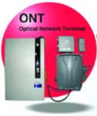
ONT Optical Network Terminal

Experience speed like never before. Forget about time spent staring at progress bars or watching the clock.