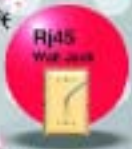
RJ45 Wall Jack

Experience speed like never before. Forget about time spent staring at progress bars or watching the clock.